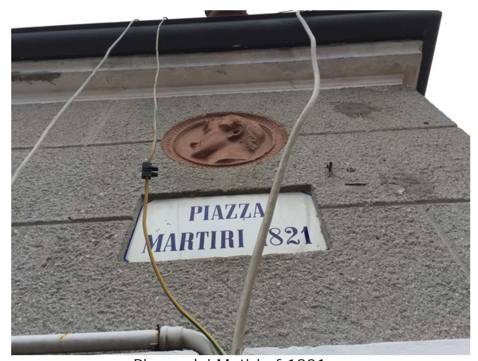
Piazza dei Matiri of 1821 or the Square of the victims of the Austrian imperators persecutions against anybody wishing freedom