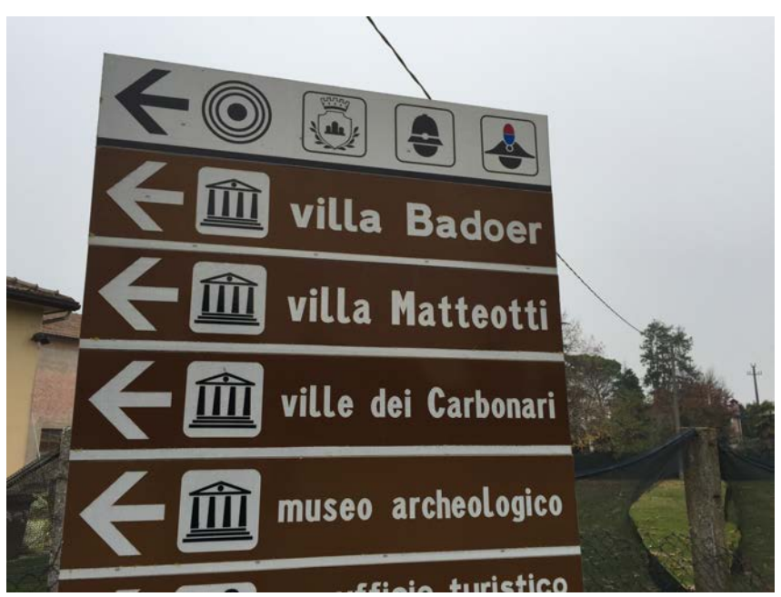
Fratta was an historically important town.

Just to give an idea of his popularities: now in Italy there are 3.292 streets waring his name.