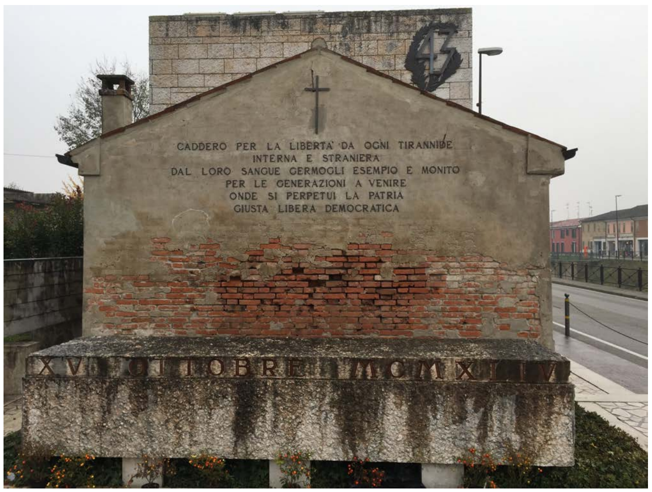
Germans executed Italians in this place in 1943, at the city centre of Villamarzana.