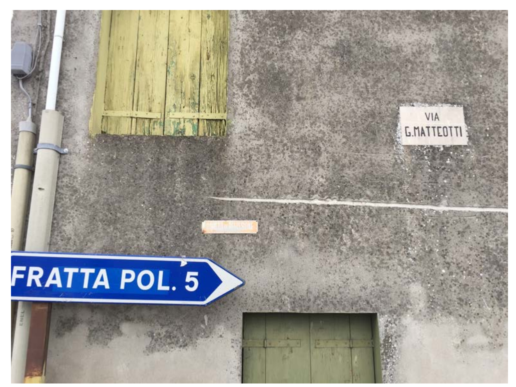
A road dedicated to Matteotti.

Giacomo Matteotti was very beloved Italians.