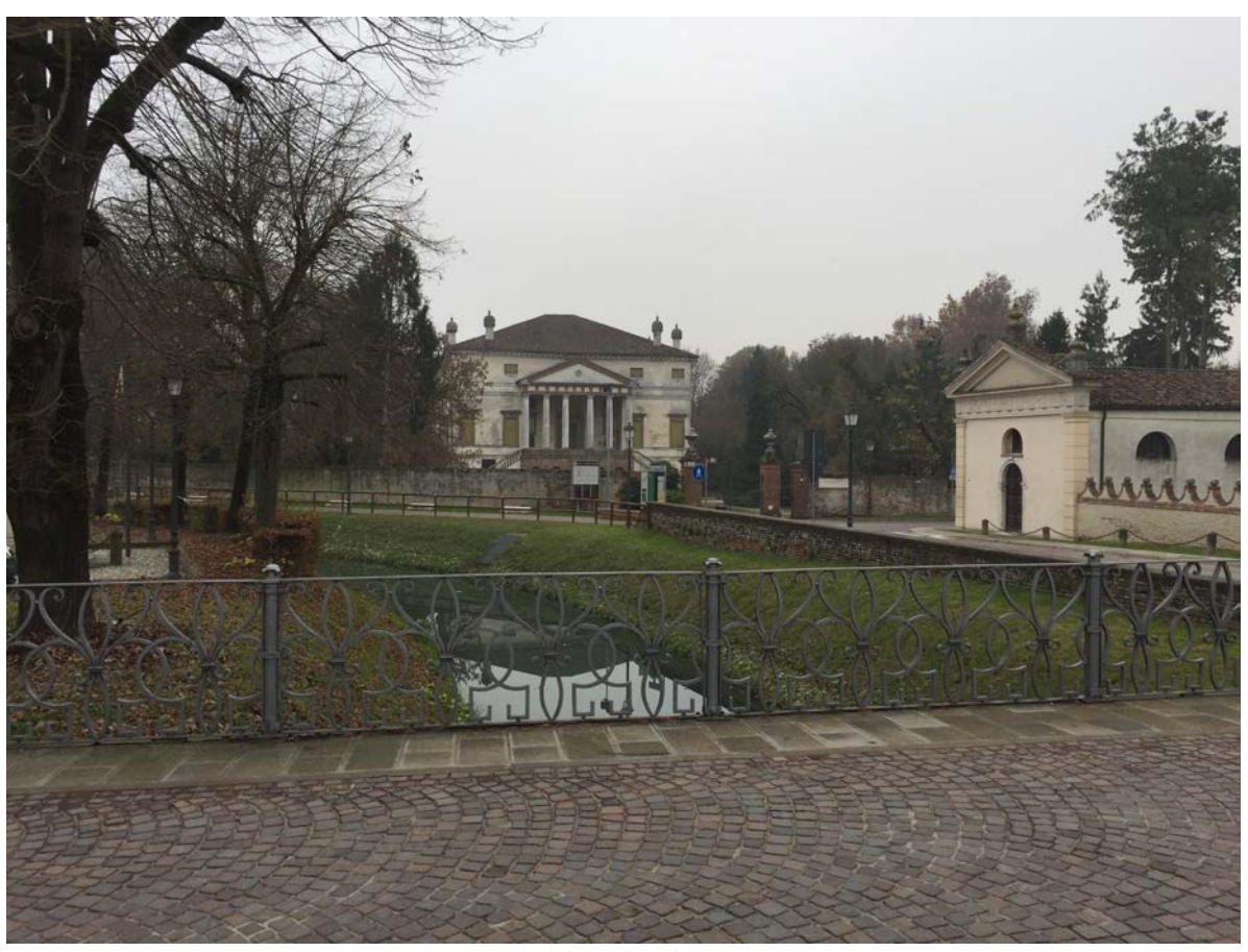
Villa dei Carbonari