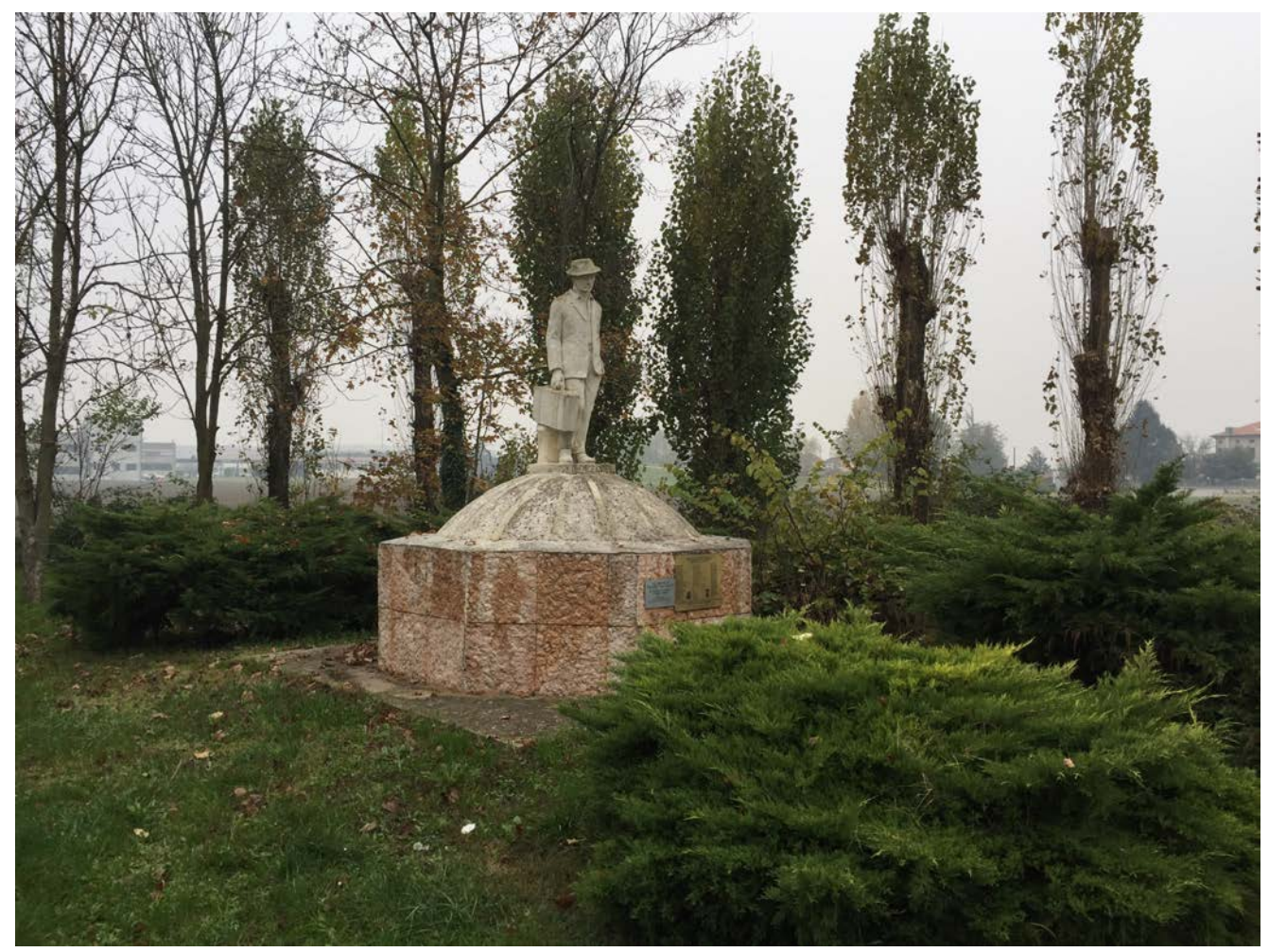
Monument to remember the many emigrants from the Polesine. Villamarzana.