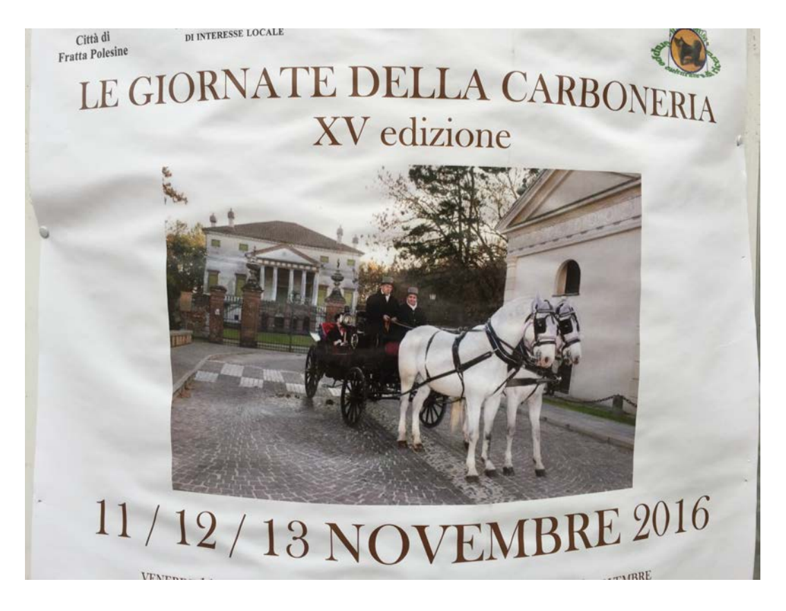
"The days of the Carboneria"