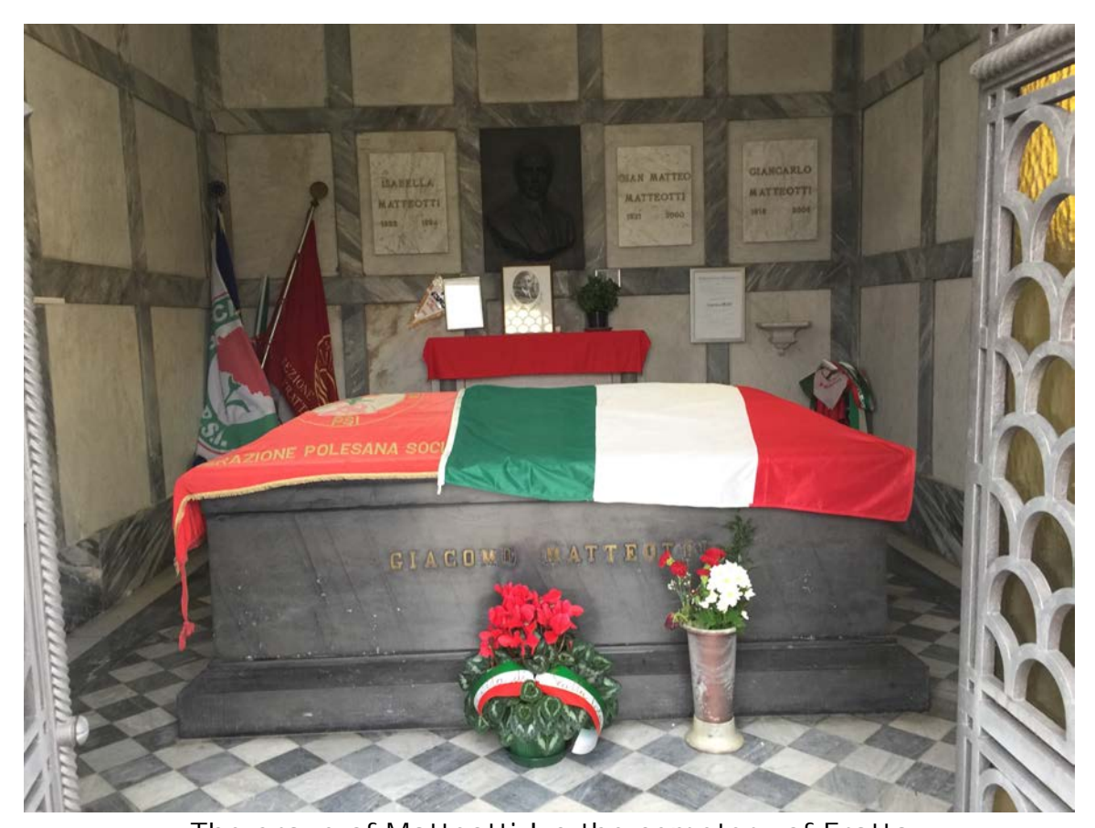
The grave of Matteotti, In the cemetery of Fratta

The house is now a museum. Check for opening time.