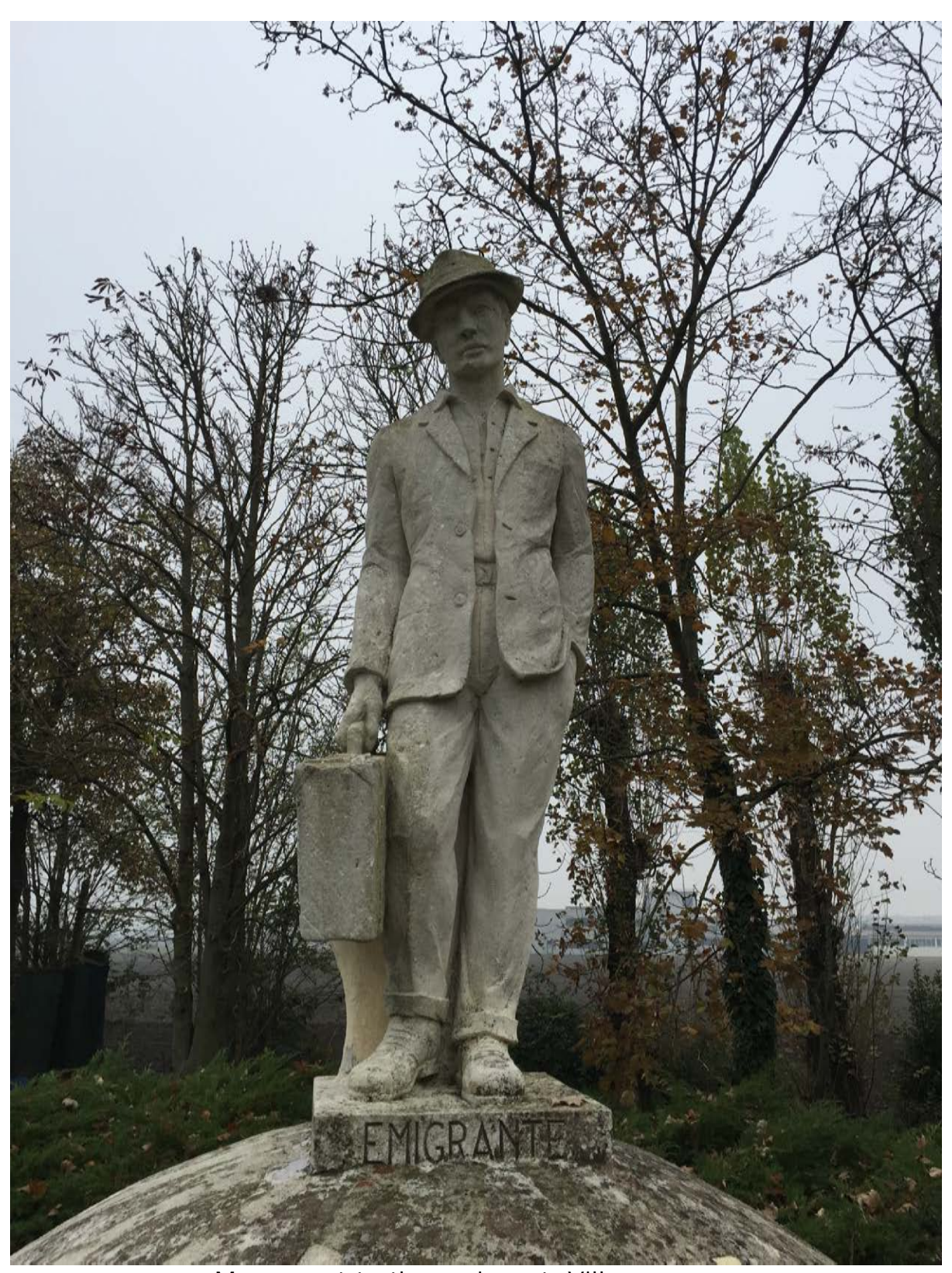
Monument to the emigrant. Villamarzana.

You should visit all the towns of Polesine.