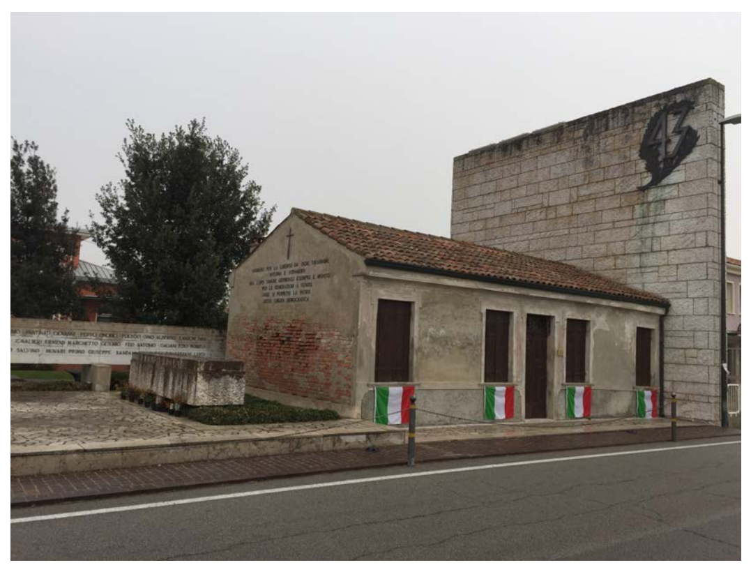
Place of execution