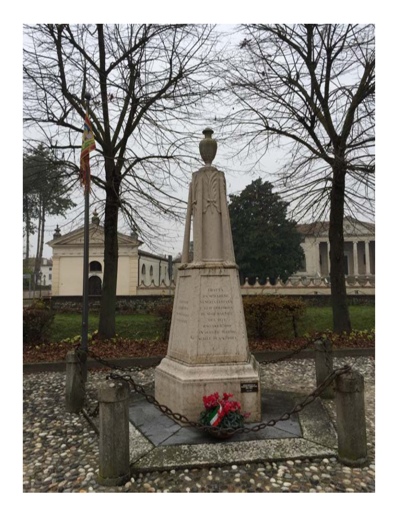
Monument dedicated to the prisoners of the Spielberg in 1821